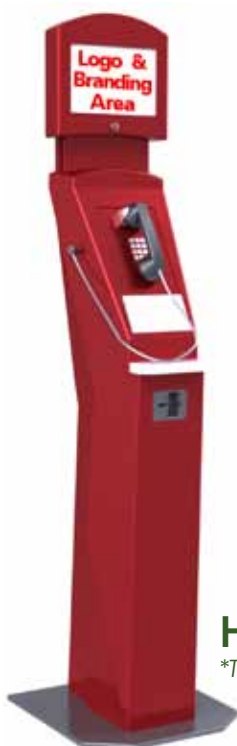
Hermes *Telephone Kiosk