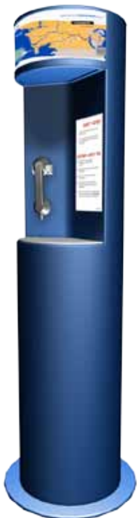
Janus *Telephone Kiosk

Parabit's Kiosk Telephones come in an array of finishes and colors. Please take a look at our website for additional information.